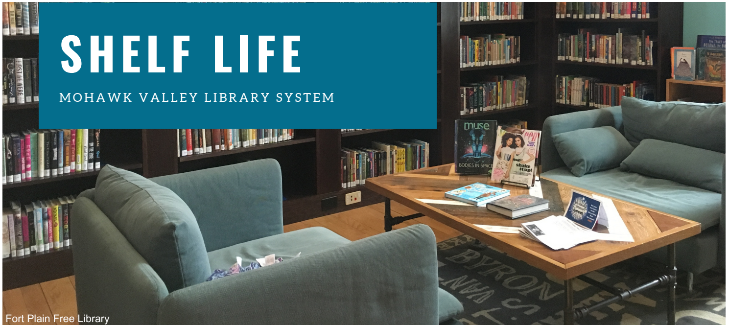
Fort Plain Free Library