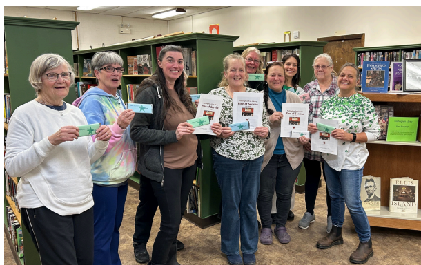
Trustees and staff at Frothingham Free Library celebrate adoption of their new Plan of Service.